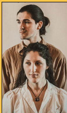
7:00 Tragedy Ann