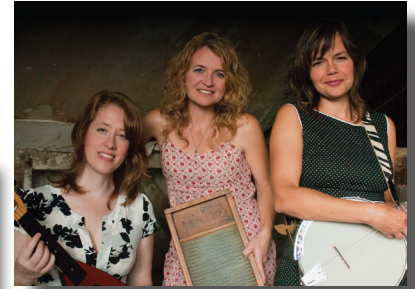
The Boxcar Lilies