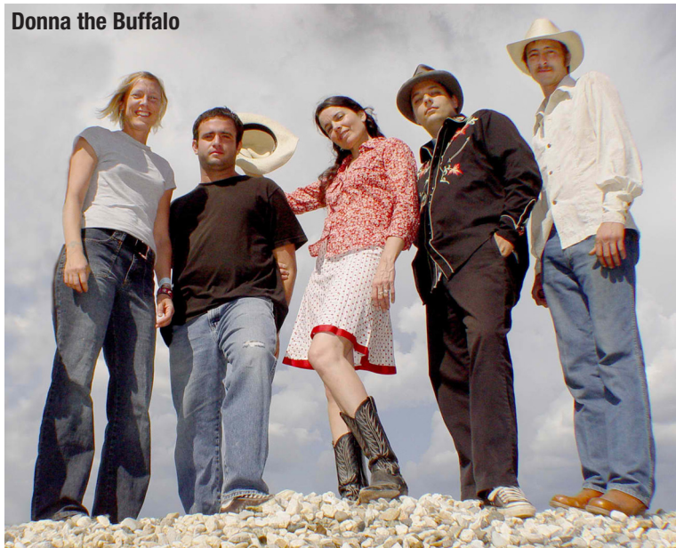
Donna the Buffalo