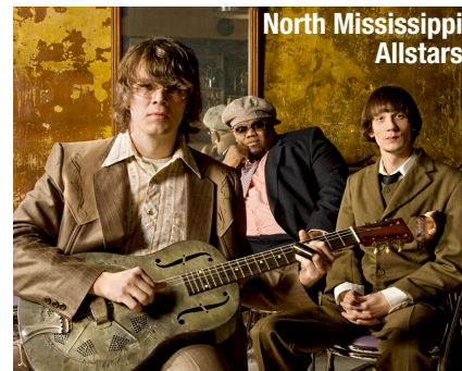
North Mississippi Allstars

Another reason for our presence on "the Island" that weekend will be to host our afternoon showcases at the Huntington Folk Festival .