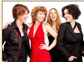
The Jammin' Divas

At Rockwood Music Hall 7pm Tues, May 14 th